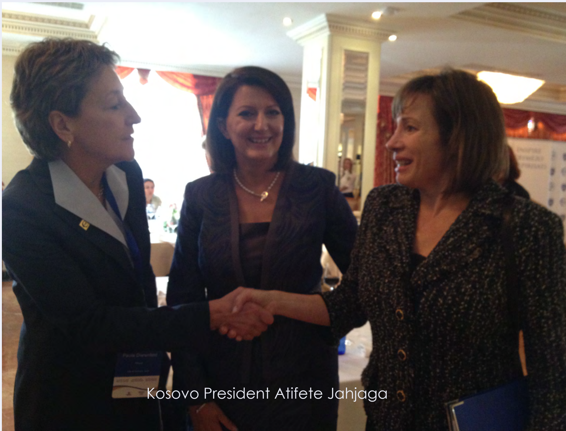
Kosovo President Atifete Jahjaga